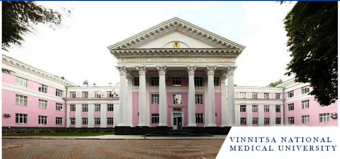
VINNITSA NATIONAL MEDICAL UNIVERSITY

6 Years MD Course (Equivalent to MBBS in India)